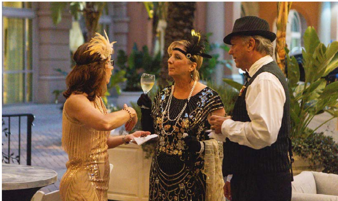
What a Night! Speakeasy Dinner at the 2024 Annual Session in Tampa